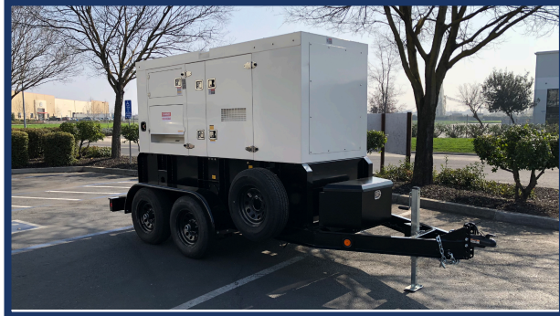
LARGE CAPACITY FUEL CELL

UQ-125: Standby Rating: 123 kVA / 99kW Prime Rating: 112 kVA / 90kW