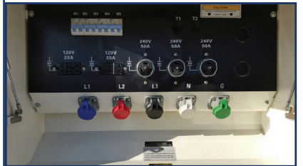
CUSTOMER CONNECTION CAM-LOCK STANDARD