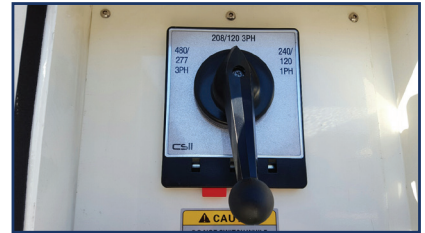
3 POSITION VOLTAGE SELECTOR SWITCH