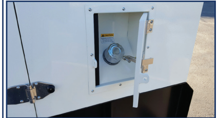
LOCKABLE EXTERNAL FUEL FILL