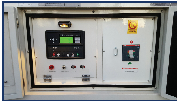
REAR CONTROL PANEL WITH MLCB