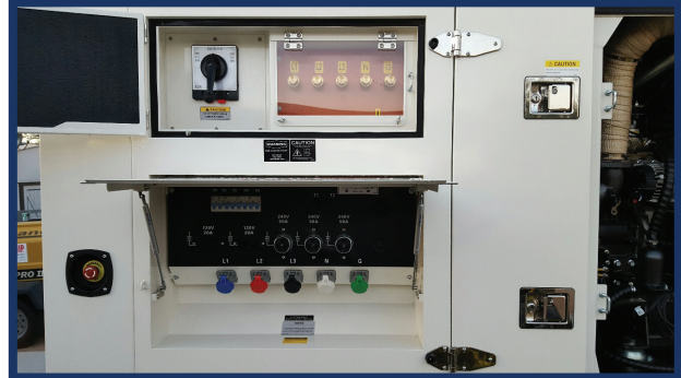
CUSTOMER CONNECTION PANEL